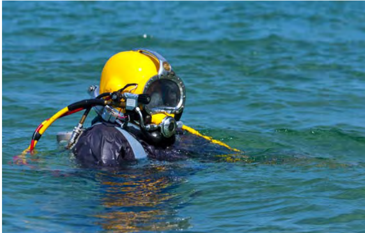
UCC Diver wearing a Kirby Morgan, Superlite 27 with a Bailout bottle.

Underwater Construction Corporation, UCC Nears 50 Years of Innovation and Job Creation continued from page 1