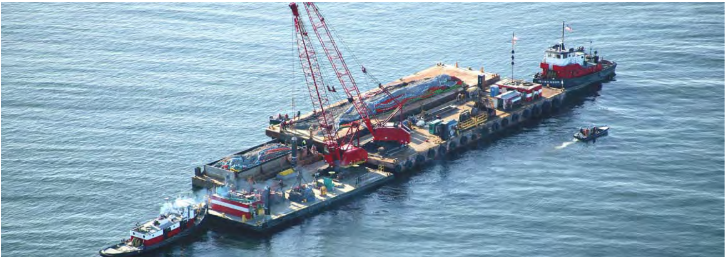
Ludington Pumped Storage Plant on Lake Michigan. 2.4 Mile fish barrier net installed annually in April and removed in Oct by UCC Divers.

UCC Nears 50 Years of Innovation and Job Creation in Connecticut, the USA, and Abroad